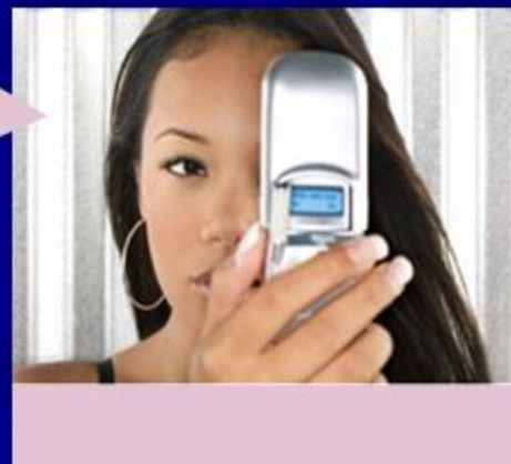
Ring back Tone subscriber