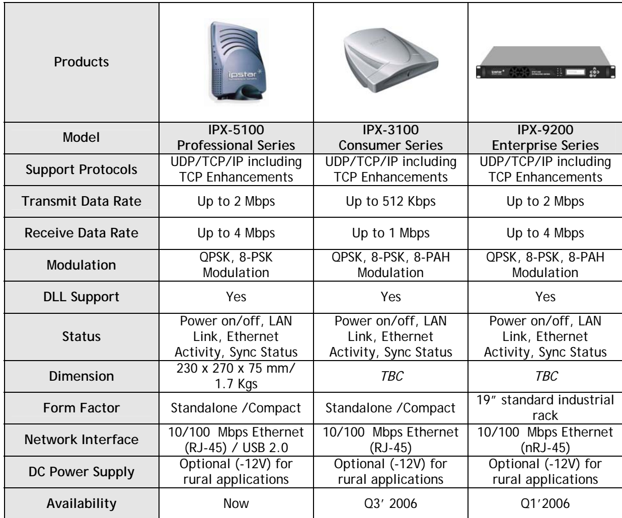
Figure 3.1: IPSTAR User Terminal Products

The IPSTAR network configuration is based on Gateway STAR topology. A user terminal will receive and transmit signals from/to a Beam, which connects with a gateway. The gateway in turn connects to other networks such as the Internet backbone, telephone network and corporate.